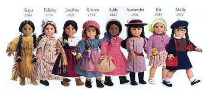
American Girl Dolls

Historical American Girl Dolls – This camp, for ages 7-12, will be held from 9:30 a.m. to 12:30 p.m. at the Medad Stone Tavern Museum from July 8-12. Campers will travel through American history with historical American Girl Dolls. They will learn about the everyday lives in the dolls' time periods by reading their stories and hearing about when they lived. The campers will write in their own journals, make crafts, play games from the doll's era and cook food from recipes they would have used. The week will end with a tea party in the parlor of the Tavern Museum.